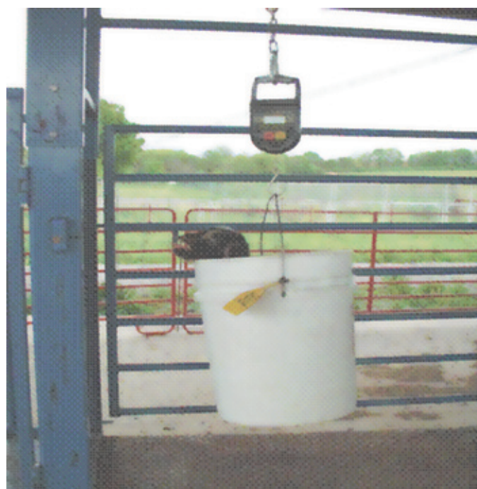
Figure 6-2. Fish scales and a plastic bucket make an excellent birth weight measuring system.

Beef producers have had a tremendous tool available to them to assist in their selection processes for the last 20 to 25 years known as expected progeny