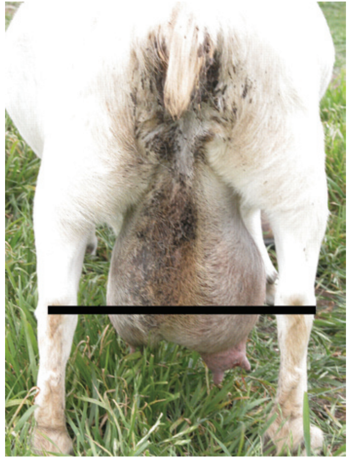
Figure 6-6. Goat doe with bad udder structure.

Does should have a minimum of two functional teats (Figure 6-7). Some breed associations will have standards that disapprove of more than two teats, but for commercial meat goat operations more than two teats can be acceptable. This depends upon how the teats are arranged on the udder.