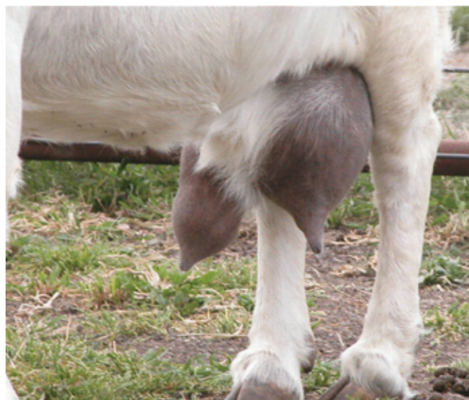
Figure 6-10. Doe with bottle teats.