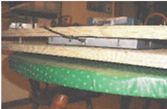
Figure 6-3. Postal scales mounted between two pieces of plywood make a nice weighing system for weanlings and does.

difference (EPD). This tool, based on performance data collected by producers and sent to their breed associations, has provided a high tech means to improve the genetics of the respective breeds, as well as increase the efficiency and profitability of beef production for the commercial cow-calf segment of the beef industry. Some of the meat goat associations have recognized the benefits of this genetic selection tool, and they have begun developing similar efforts to provide EPDs for their producers. For example, the American Boer Goat Association is developing a model similar to that used in the sheep industry that allows for multiple births in the calculations. They wrote a grant and received funding for a cooperative effort between their association, Virginia Polytechnic Institute and State University, and Texas A&M University to develop a sire evaluation model. They have collected over two thousand records