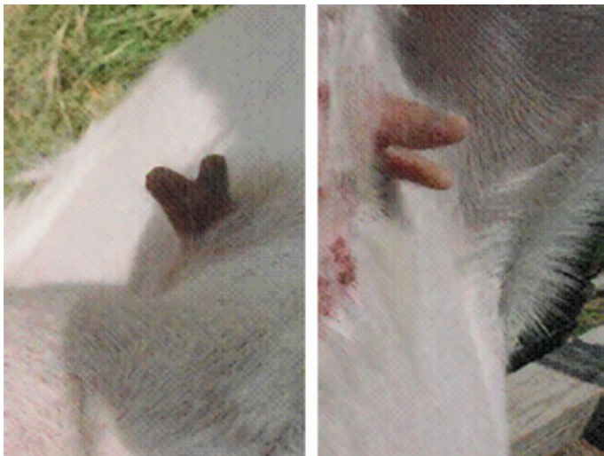
Figure 6-8. Does with fish teats. Left: unacceptable Right: acceptable