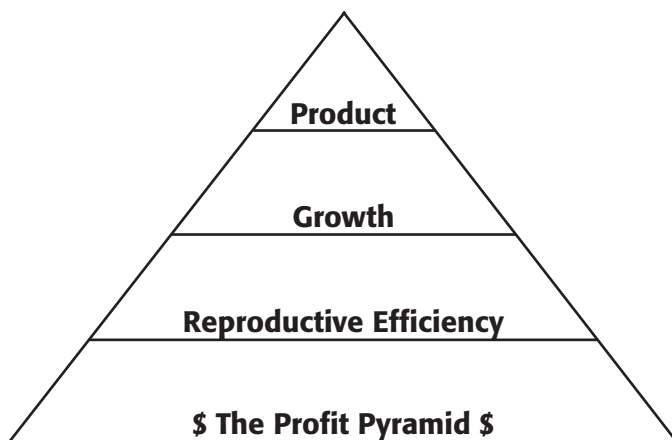
Figure 6-1. The profit pyramid.

Though different producers in the goat business have different goals based on individual preferences, level of experience, physical and financial resources, existing situations, and managerial abilities the economically important traits are common to all levels of production in the real world of commercial meat goat production. The profit pyramid illustrates the hierarchy of economically important traits in commercial meat goat production (Figure 6-1). Reproductive efficiency is the foundation of profitability and includes such traits as fertility, prolificacy, mothering ability, milk production, and longevity to name a few. Simply put, having more kids to sell for a given number of does will influence the bottom line of the operation more than any other factor. Adding value to those traits are the growth traits of the kids such as weaning weight, yearling weight, rate of gain, and feed efficiency. At the top of the pyramid